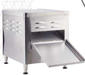
ECT-500 back view